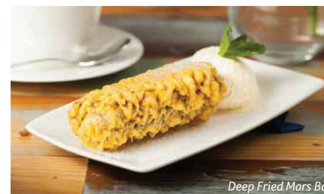
Deep Fried Mars Bar