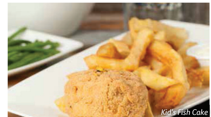
Kid's Fish Cake