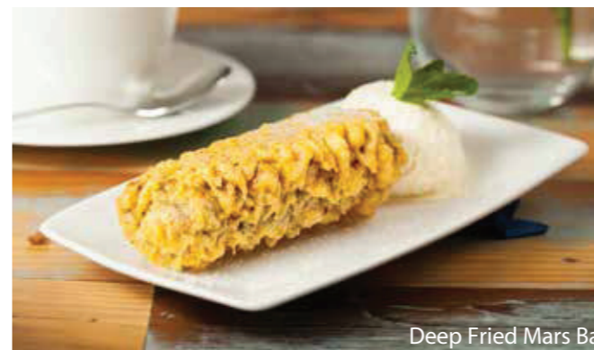
Deep Fried Mars Bar