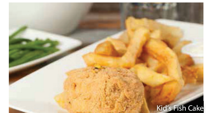
Kid's Fish Cake